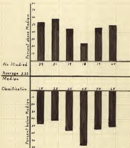
Figure I. Percent in each group above and below the average median for the Graduate Groups.